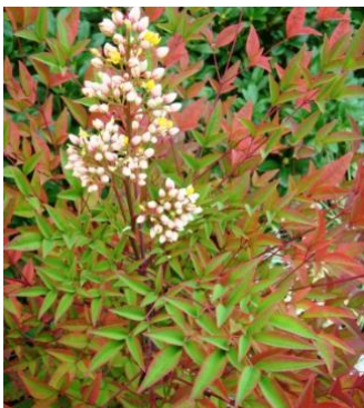
15. Nandina domestica x 1 Evergreen, fantastic year round foliage interest Large summer flowers & winter fruit