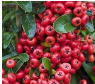
16. Pyracantha Saphyr Rouge x 2 Evergreen wall shrub. Fruit for birds