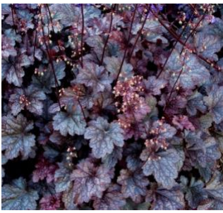
12. Heuchera Plum Pudding x 3 Evergreen foliage interest