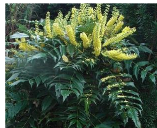
19. Mahonia Charity x 2 Evergreen shrub. Scented.