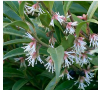
17. Sarcococca hookeriana Digyna x 17 Evergreen scented small shrub