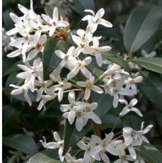
13. Osmanthus burkwoodii x 5 Scented evergreen, suitable for elevation