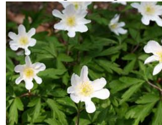
16. Anemone nemorosa x 12 Native ground cover