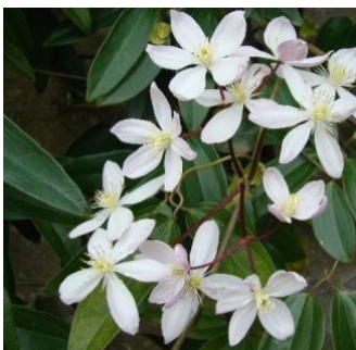
16. Clematis armandii x 3 Scented evergreen climber