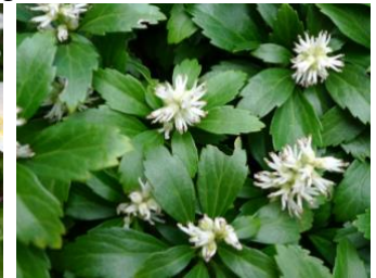
Pachysandra terminalis x 12 Evergreen ground cover