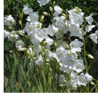
16. Campanula persicifolia alba x 6 Semi- evergreen long flowering to soften fence