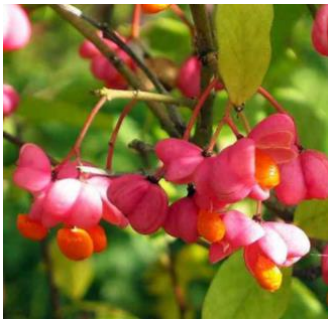
14. Euonymus europaeus x 1 Native small tree with good autumn colour Stunning autumn fruit